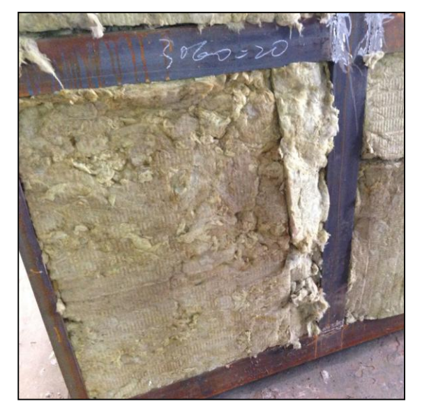
Some other factories' insulation material and effect