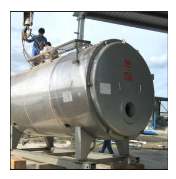
OTHER FACTORY'S BOILER