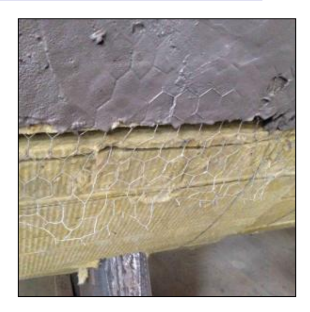
ZOZEN Boilers' Insulation Material 2. (Refractory cement on the rock wool)