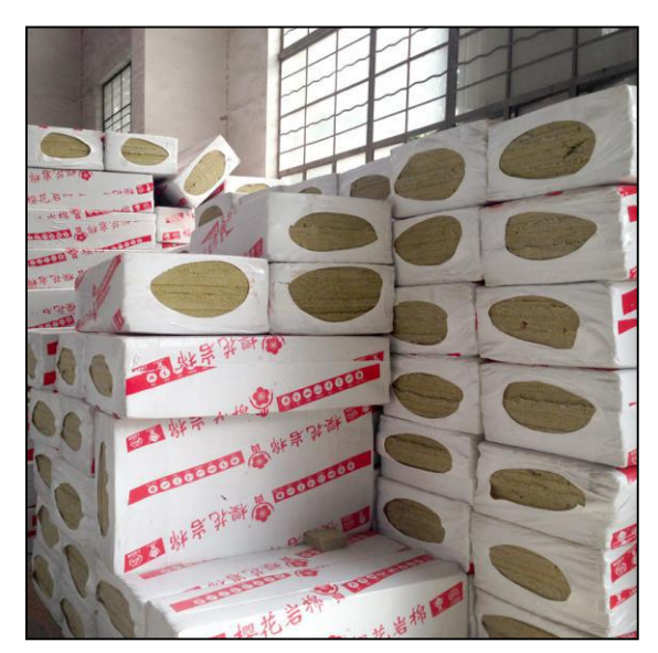
ZOZEN Boilers' Insulation Material 1.

ZOZEN purchases the best rock wool in China with the brand "Yinghua", and we have one more job to put refractory cement on the rock wool. It can keep the water away from the rock wool. Keep the rock wool dry. Only 2-3 boiler factories in China do the job.