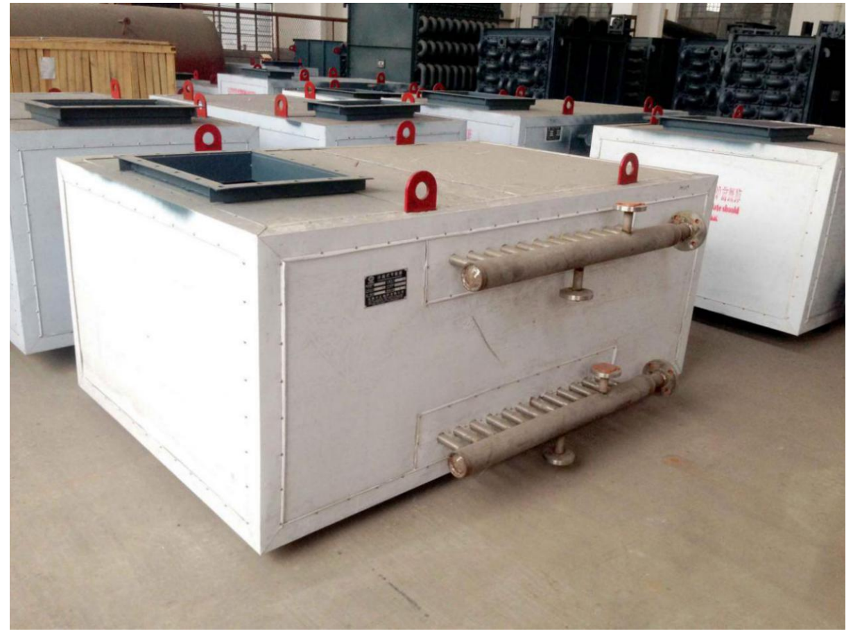
ZOZEN CONDENSING ECONOMIZER